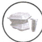
STYROFOAM™ & TAKE-OUT CONTAINERS

Not everything can be recycled. Place these items in the trash.