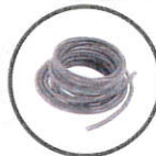
HOSES & ROPES