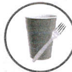
CUPS, LIDS & UTENSILS